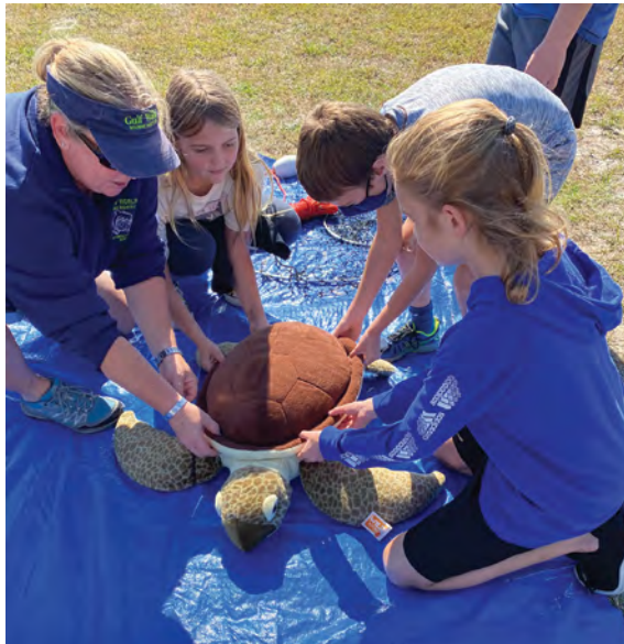
Image 3. Students are participating in a mock turtle stranding. In this photo, they are working alongside a scientist to measure, weigh, and observe a stranded turtle. Together they moved the turtle to a safe location for medical help.