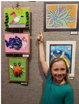
Image 4, 5, 6. A local fishing rodeo showcased our 3rd-grade trash art. 100 students' art pieces were displayed at the art show, along with posters communicating the purpose of the art and the stewardship activity of removing marine debris from area beaches.

created trash art and participated in a school-wide marine debris art contest. Our art teacher, Jessica Hughson, found inspiration in the Washed Ashore curriculum and guided students to create art from marine debris collected during beach cleanups.