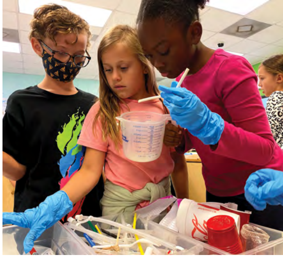
Image 2. Students are using marine debris to learn about the properties of matter.