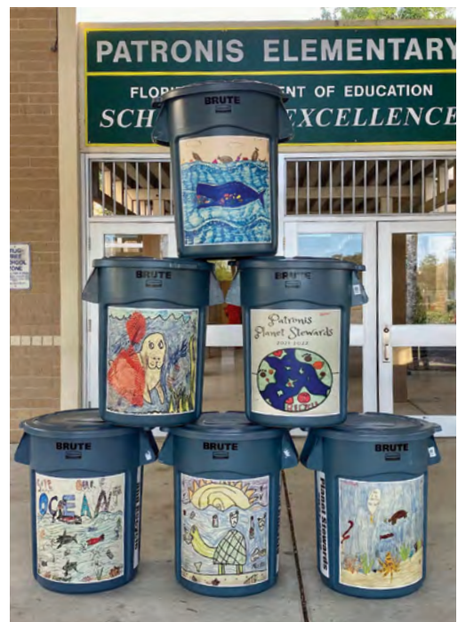
Image 8. The trash cans created from the marine debris art contest are stacked in front of our school.

The art contest was a school-wide event; we received more than 55 submissions. Students drew pictures of sea turtles surrounded by fishing nets, plastic bottles, and spoons floating in an ocean filled with wildlife. They chose messages like "Save Our Beaches" and "Be a Part of the Solution...Not