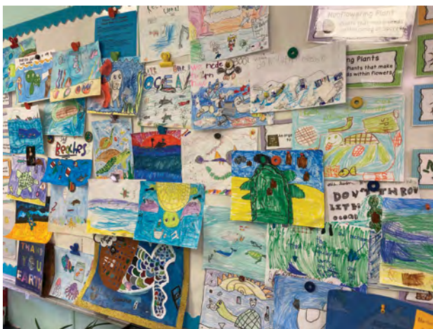
Image 7. 87 students submitted artwork for the marine debris art contest. The artwork was displayed in the STEAM Lab before the winning artwork was chosen. This image shows the artwork displayed in the classroom.

Artwork included a sea turtle made from buckets and shovels, a crab made from spoons, birds made from cups and straws. The artwork caused people to stop and think and wonder. It also provided an educational opportunity for our community to learn about the impact of marine debris. The art contest allowed students to share their learning about marine debris in a creative format.