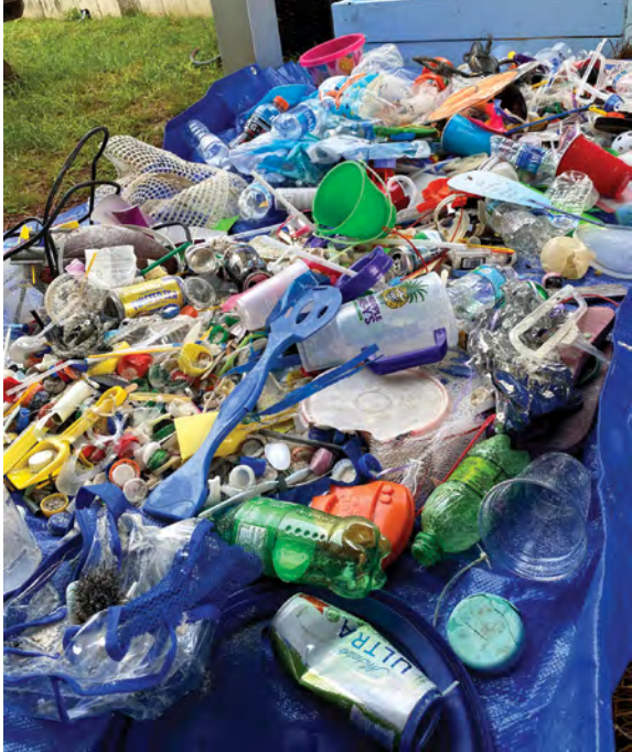
Image 1. Marine debris from beach clean-ups is placed on a tarp outside of the STEAM Lab. The marine debris in this photo was used in the STEAM Lab for students to sort, measure, and weigh.