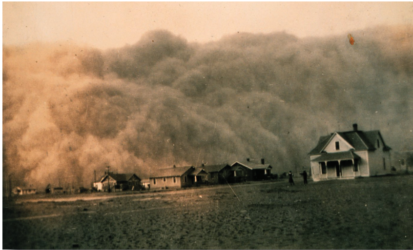
Dust storm approaching Stratford, Texas. April 18, 1935

The storm took place at sundown, it lasted through the night, When we looked out next morning, we saw a terrible sight. We saw outside our window where wheat fields they had grown Was now a rippling ocean of dust the wind had blown.