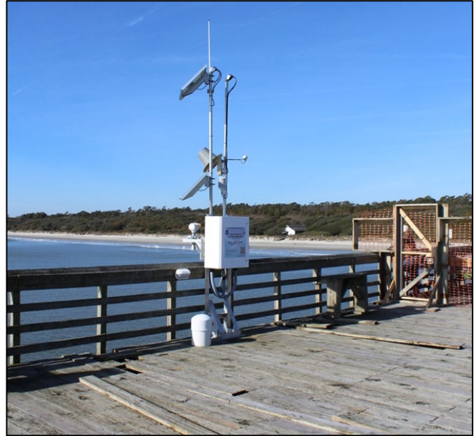
Figure 3.11-4. Tide Gauge on a Pier

There are many piers listed or eligible for listing on the NRHP throughout the U.S. as either individual resources or as contributing elements of an historic district. Hanalei Pier in Hawai'i, for example, is a typical finger pier constructed in the 1920s. The structure was used seasonally, primarily to transport rice from Hanalei to Honolulu. It is one of approximately a dozen remaining structures of this type in the state and is listed on the NRHP for its historical significance as one of the last remaining vestiges of the rice industry in Hanalei (NPS, 1979).