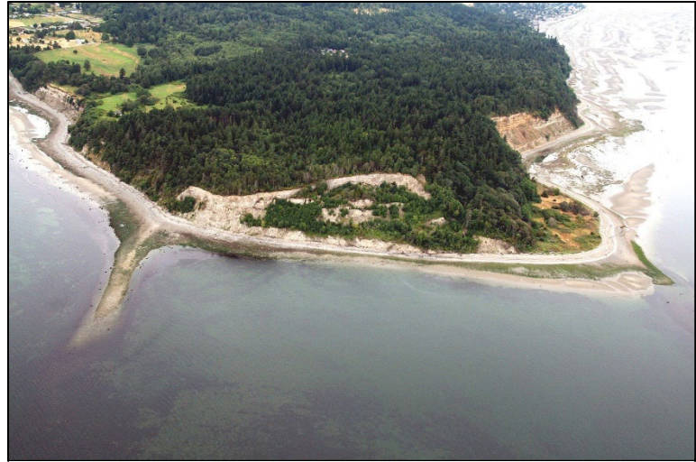
Figure 3.11-2. Lily Point TCP, Washington

how well it had been treated, thus allowing the capture of other fish and insuring a return the following year." (Whatcom Land Trust, No Date). In the late 19th century, non-Indian fish traps replaced traditional reef nets. Alaska Packers purchased a cannery at Lily Point in 1884. The cannery was closed in 1917, leaving pilings and debris still visible today.