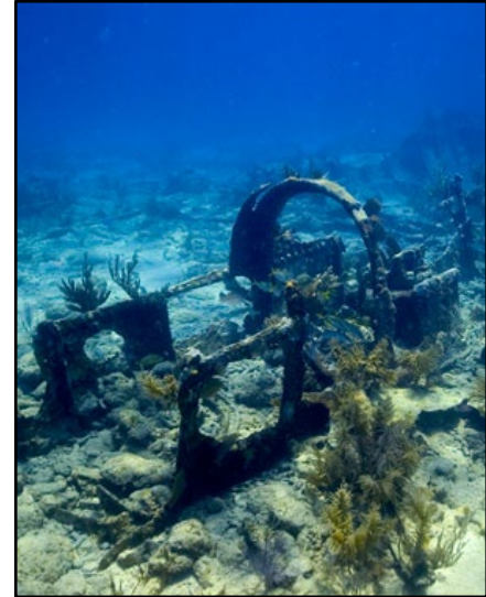
Figure 3.11-1. City of Washington Shipwreck, Florida Keys National Marine Sanctuary

Florida has one of the longest continuous coastlines in the country and, as a result, the range of underwater archaeological sites is broad and covers thousands of years. Florida's Bureau of Archaeological Research within the Department of State examines and interprets underwater sites. They have conducted surveys and excavations on both prehistoric and historic sites located offshore and in rivers and sinkholes - from submerged Native American middens and habitation sites to the remains of sunken steamboats and schooners. In 1987, Florida began to develop a statewide system of underwater parks featuring shipwrecks and other historic sites. Currently, there are 12 shipwrecks designated as underwater reserves (Florida DOS, No Date). Thousands more shipwrecks and offshore cultural and historic resources are likely to be present off of the Florida coast; there are over 1,000 shipwrecks along the Florida Keys National Marine Sanctuary alone ( Figure 3.11-1 ) (NOAA, No Date-d).